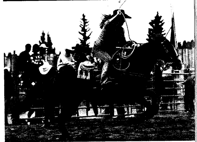
▲ Top: A stone carving showing a procession with horses in the ancient city of Persepolis (550 BCE). Bottom: A modern rider at the Tsuut'ina Nation Rodeo. Could the stories of the people in these images be significant? In what ways? to whom?